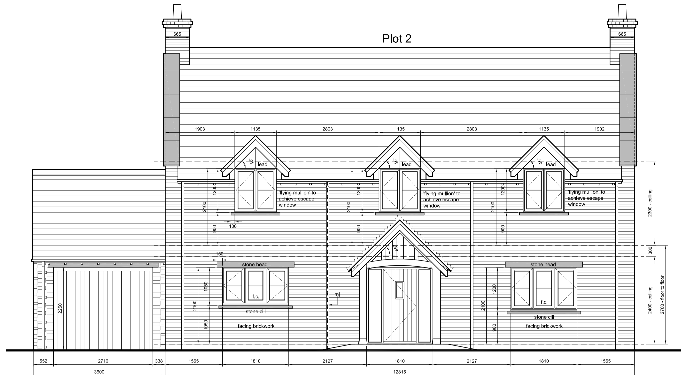
Proposed Front Elevation (North West) Scale 1:50 @ A1 / 1:100 @ A3