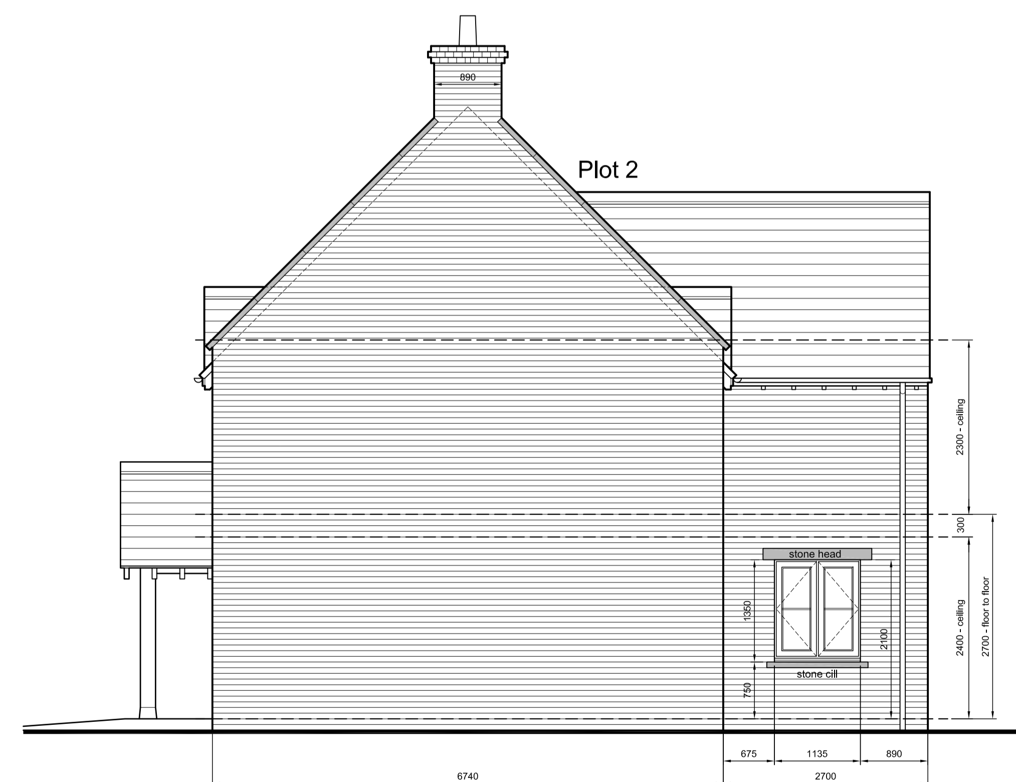
Proposed Side Elevation (South West) Scale 1:50 @ A1 / 1:100 @ A3