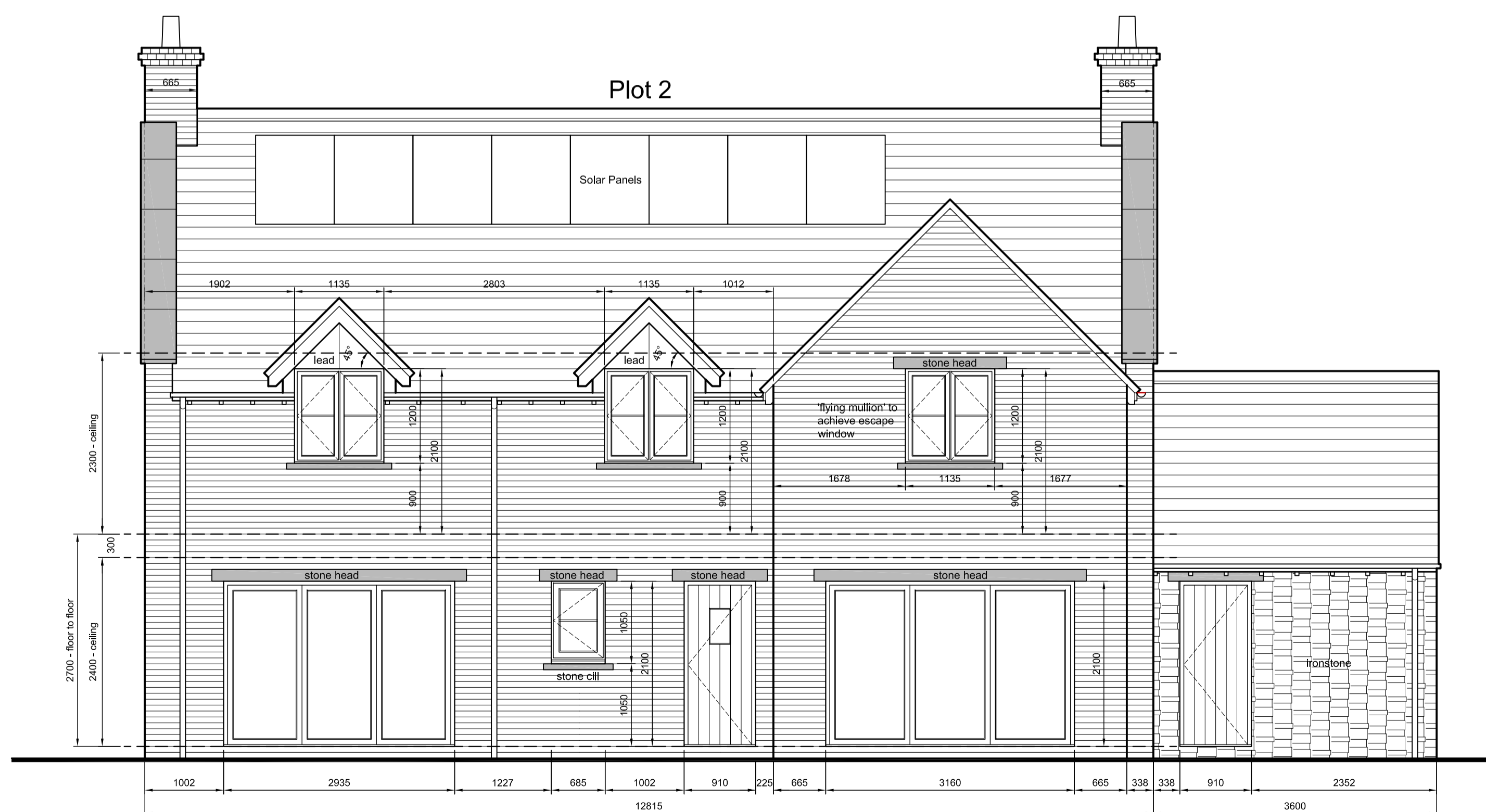
Proposed Rear Elevation (South East) Scale 1:50 @ A1 / 1:100 @ A3